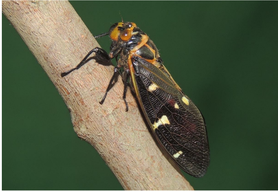
Date of Publication: 12th April, 2021